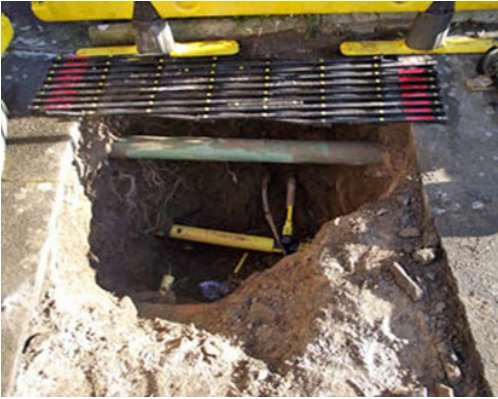
The closed Trench-Protect trellis is laid across end of the open trench.