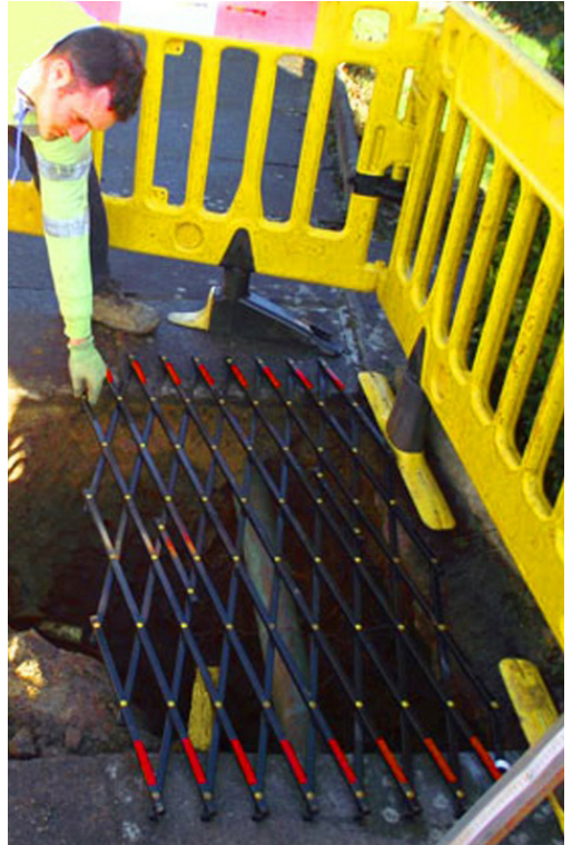
Tough but light to deploy.

STS Safety Trellis mats are deployed so that areas The light Trench-Protect trellis expands over the open trench to form a resilient and very strong cover, preventing falls into the trench.