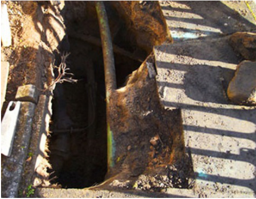
The hazard of the hole in the road.