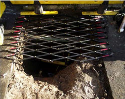
The trellis is pulled out to form a safety cover over the trench; the trellis can be clipped down for extra stability.

They can be dislodged by traffic or wind; or moved by others, e.g. children playing. Operatives working inside the barriers have no safeguard from falling into the unprotected trench or excavation.